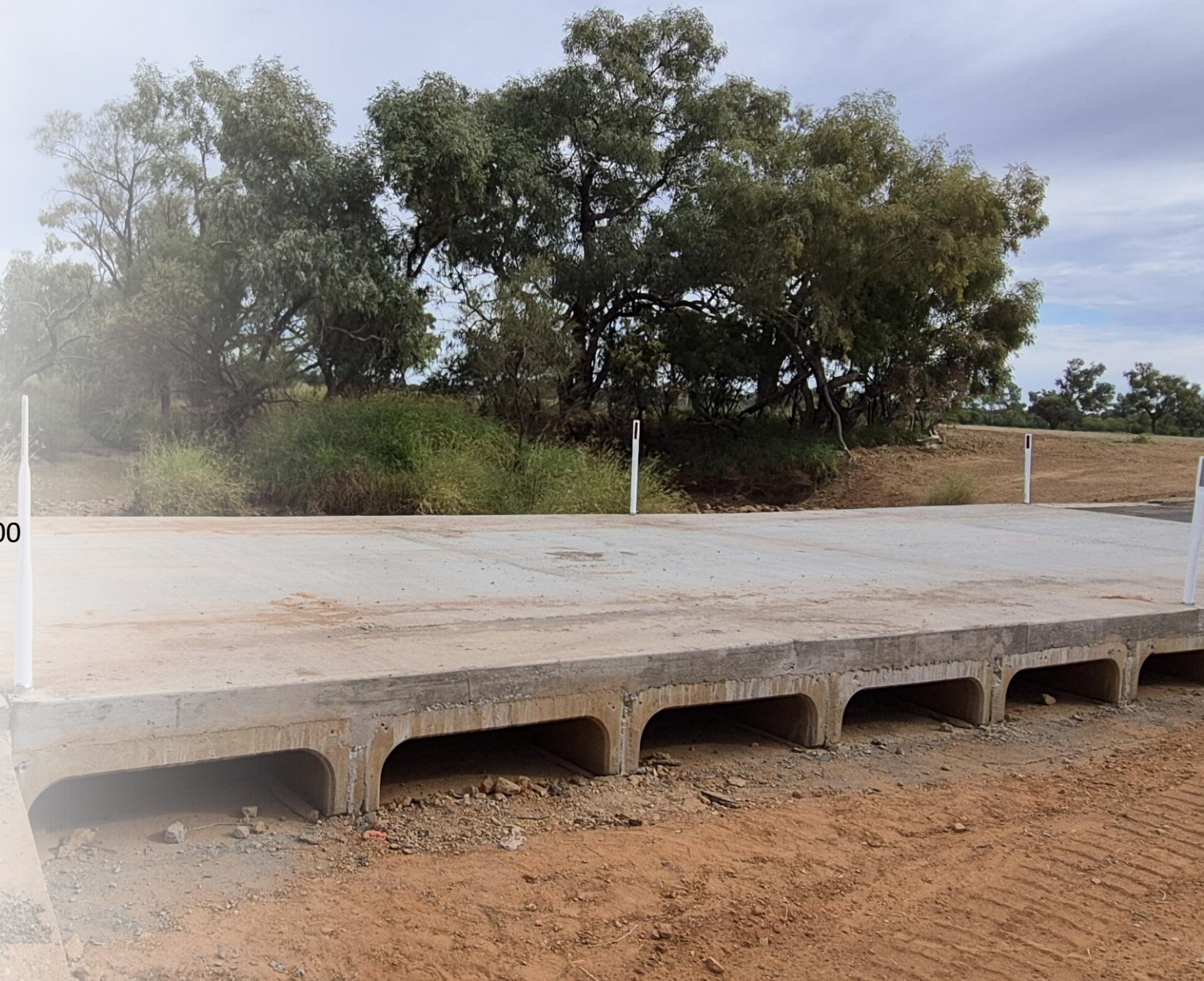
Photo: Monkey Coolah Floodway, Kyabra Road

All projects scheduled for completion by 30 June 2025