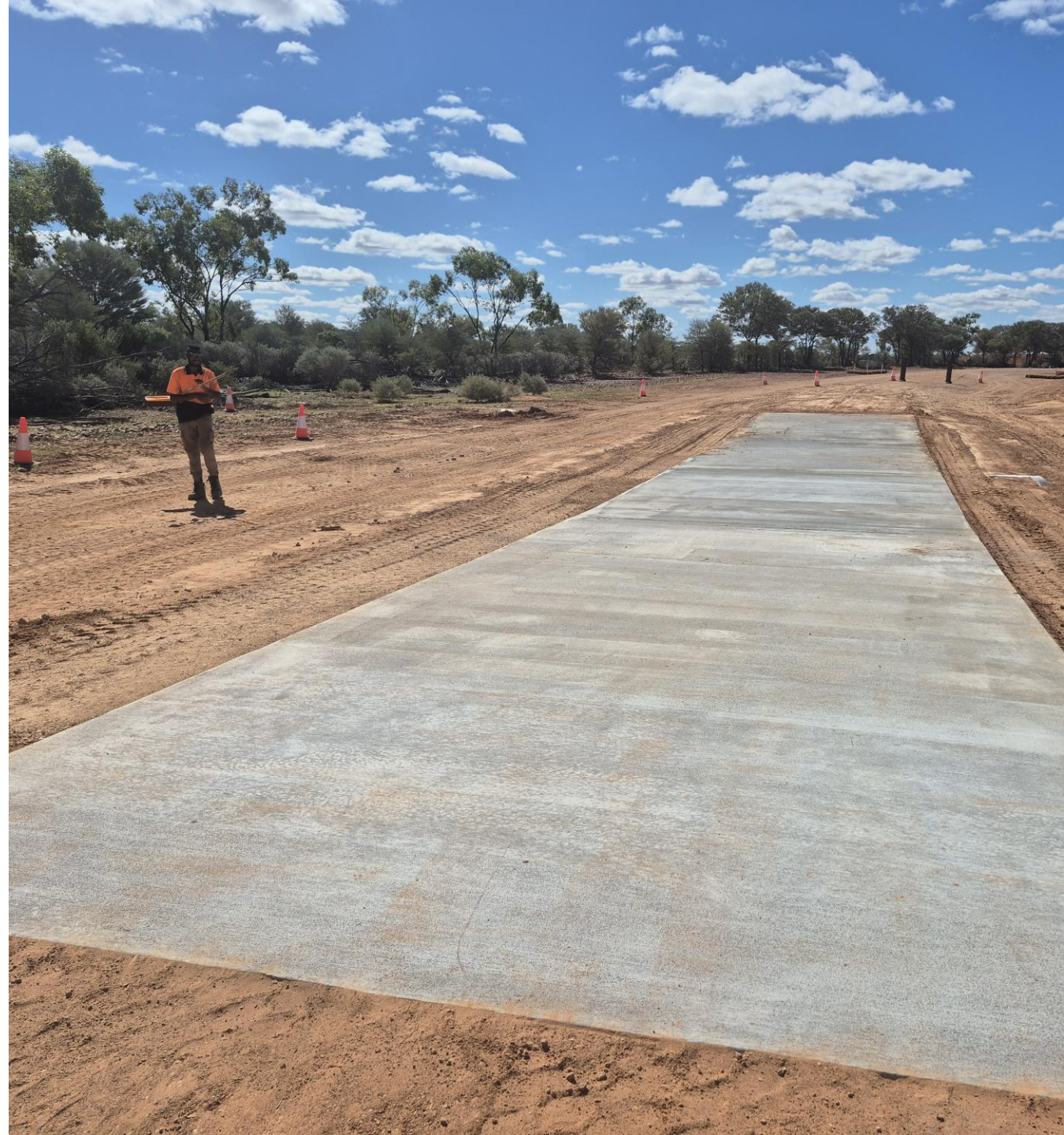
Photo: Tobermory Road Floodway

Most projects scheduled for completion by 30 June 2025