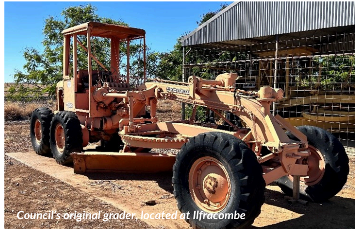
Council's original grader, located at Ilfracombe

On a recent trip to Ilfracombe, Quilpie Shire Council's original motor grader was found. Dating back to 1960, it bears a plaque sharing its history since its original purchase.