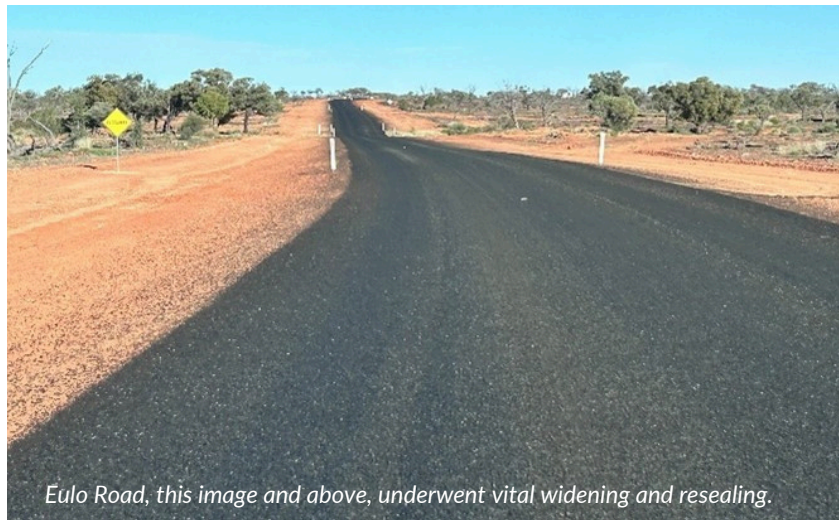
Eulo Road, this image and above, underwent vital widening and resealing.