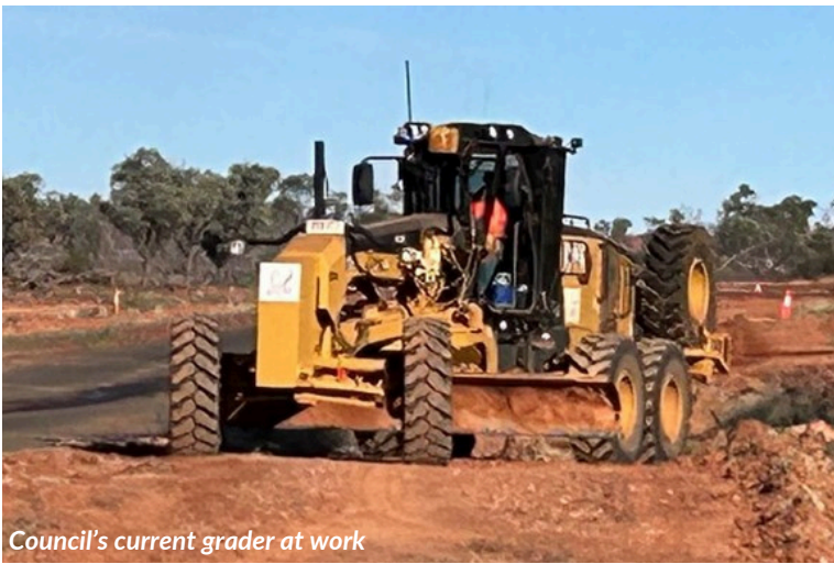
Council's current grader at work