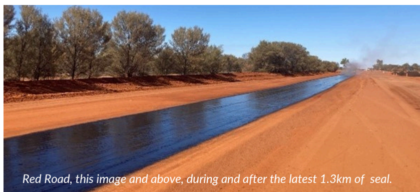
Red Road, this image and above, during and after the latest 1.3km of seal.