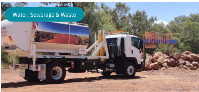
Water, Sewerage & Waste