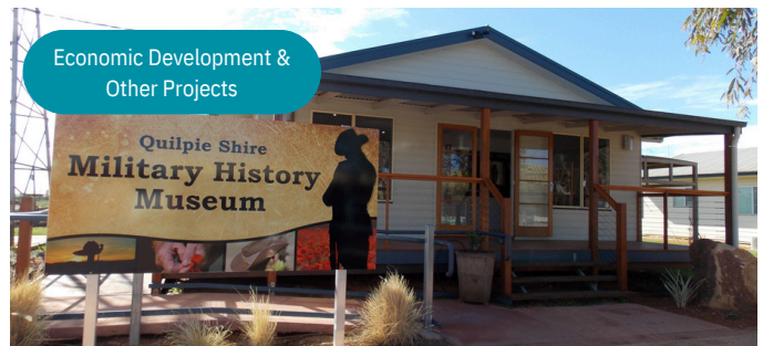
Economic Development & Other Projects