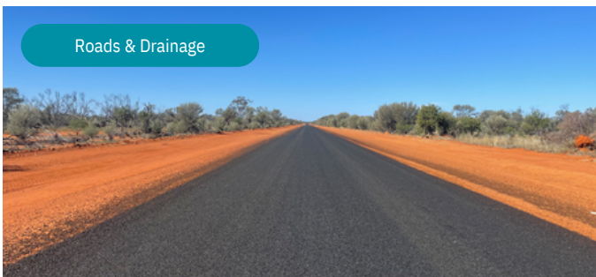
Roads & Drainage