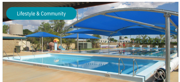
Lifestyle & Community