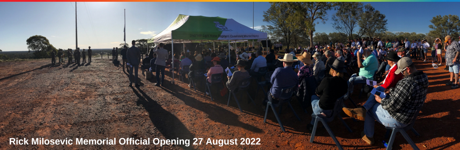
Rick Milosevic Memorial Official Opening 27 August 2022