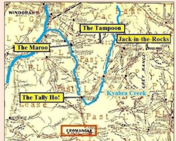
Road Map of Queensland (1913)

These pubs were built at various times between about 1884 and 1913. After some years, they all closed due to lack of business (with the advent of motorised trucking) or as a result of an accidental fire. After each the pub had closed, it was stripped bare of outbuildings, windmills and any reusable timber and roofing iron. Certainly the neighbouring property owners were right into 'recycling' long before it became the trendy word it is today.