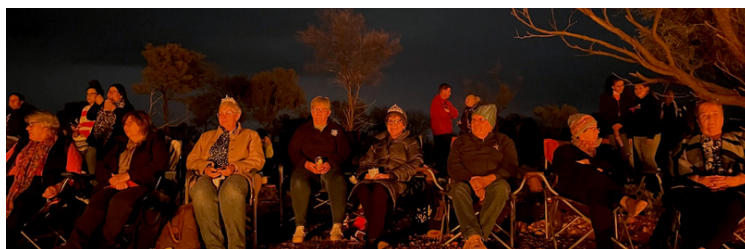
Jabiru Street Quilpie footpath works nearing completion