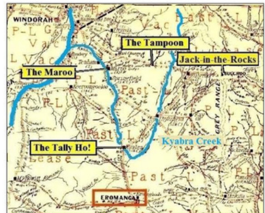
Road Map of Queensland (1913)

These pubs were built at various times between about 1884 and 1913. After some years, they all closed down due to lack of business (with the advent of motorised trucking) or as a result of an accidental fire. After each the pub had closed, it was stripped bare of outbuildings, windmills and any reusable timber and roofing iron. Certainly the neighbouring property owners were right into 'recycling' long before it became the trendy word it is today.