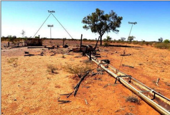
Watering for stock. Windmill has been relocated