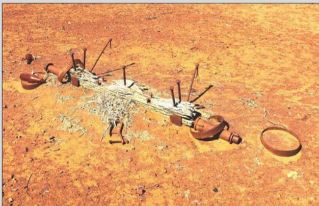
Remains of a sulky