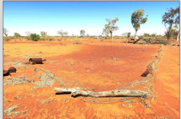
Remains of sheep or goat pen