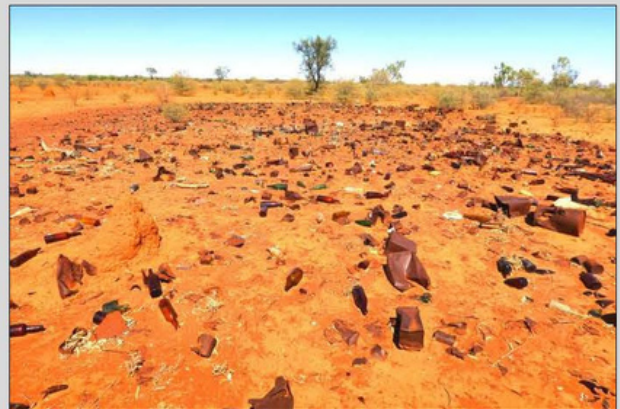
The rubbish tip covers nearly 1 acre