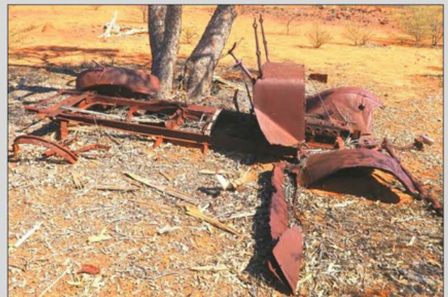
Remains of a 1925 Willys Overland

NOTE. These ruins are on 'Regleigh'. Access is only possible with prior permission from the Landowner.