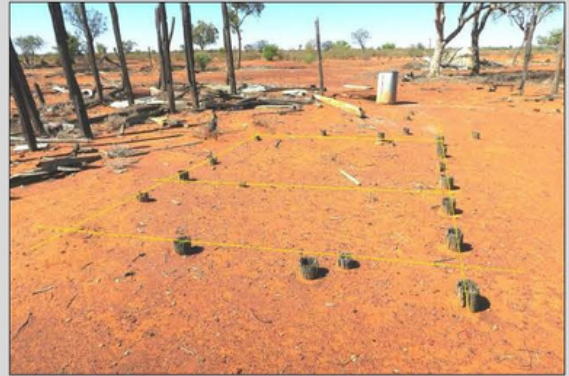
The licensee's house has been relocated