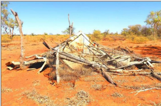
Remains of the meat house