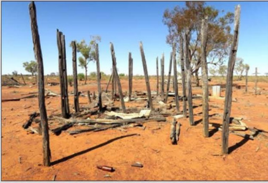
Stripped of tin and planks but no evidence of a fire