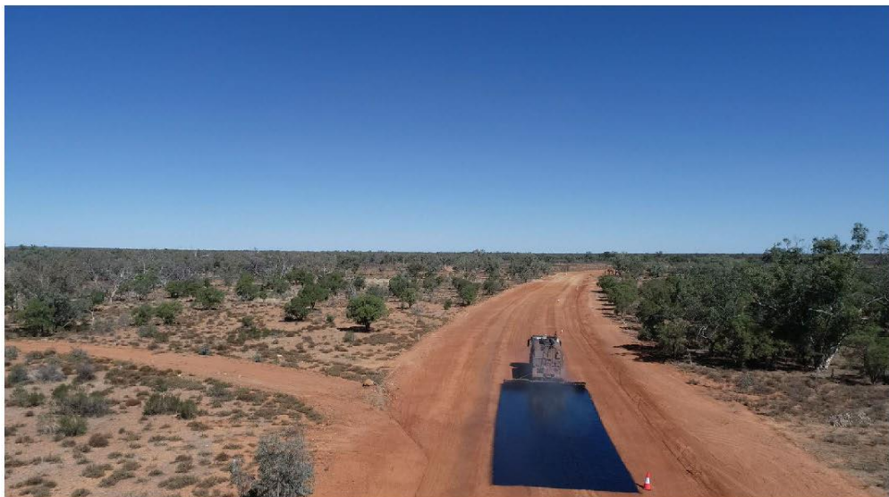
Start of complimentary funded sealing on Onion Creek Road.