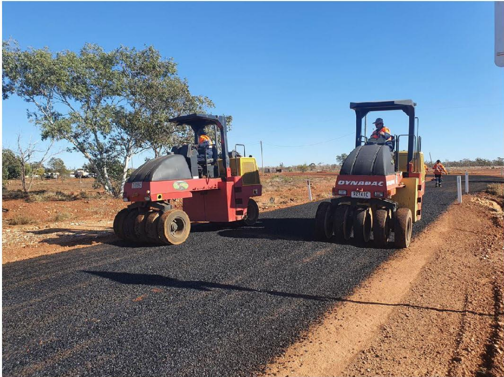
Seal work on Cheepie Access Road.