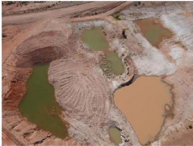
Pit # Pinkenetta Road pit

Work on the pit at CH 60 on Adavale Black Road nearing completion.