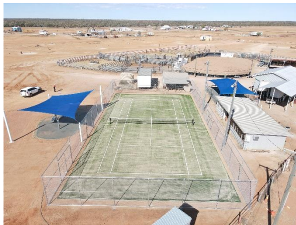
Adavale Tennis court

The Toompine and Adavale Tennis courts are complete.