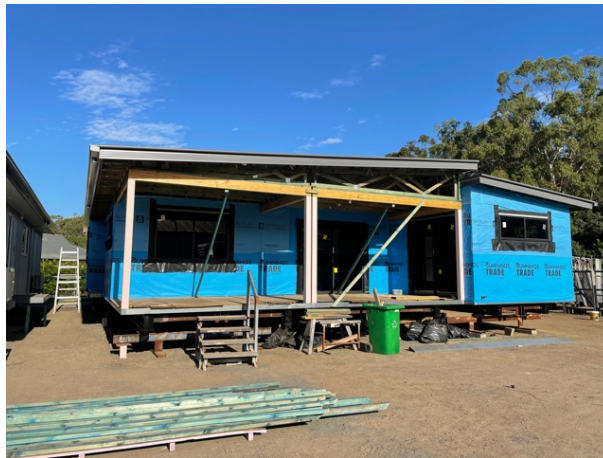
Galah Street, Quilpie.

The new houses continue construction in Lawnton. They are due on site mid-June.