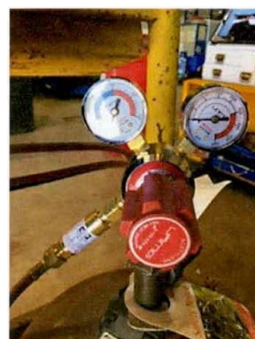
New gauges and welder